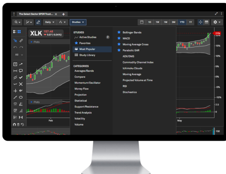
Figure 2 - ChartIQ's UX capabilities.